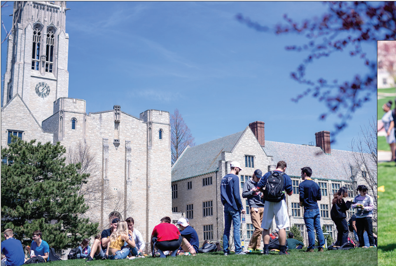
Centennial Mall was the place to be April 22: The weather was glorious for Student Appreciation Day.