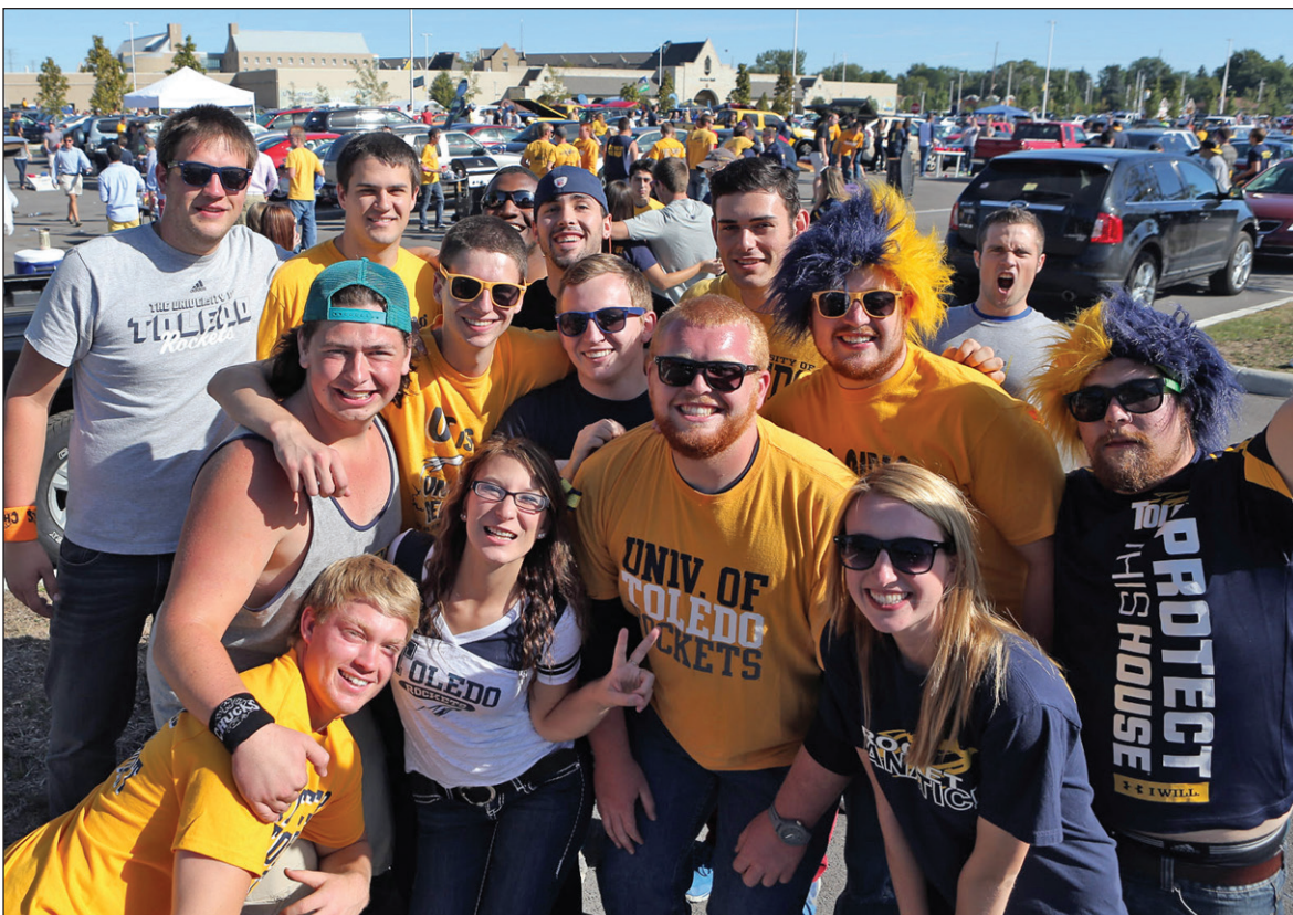
TRUE COLORS: Fans tailgated and showed their UT spirit before the home opener Saturday.