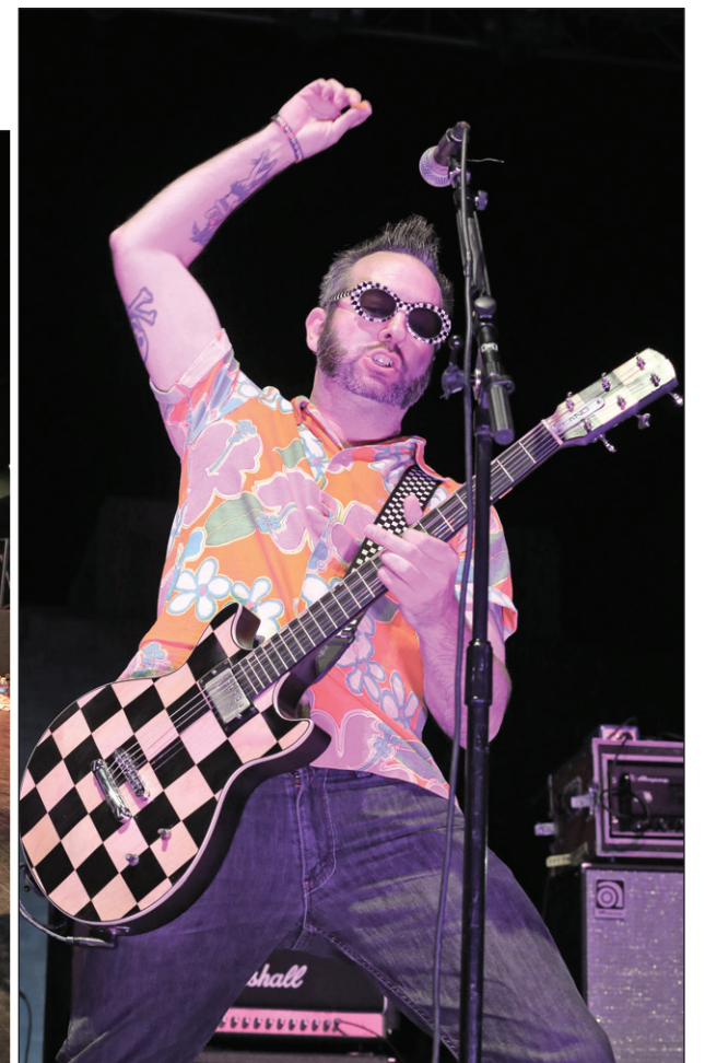
CHECK IT OUT: Reel Big Fish front man Aaron Barrett rocked.