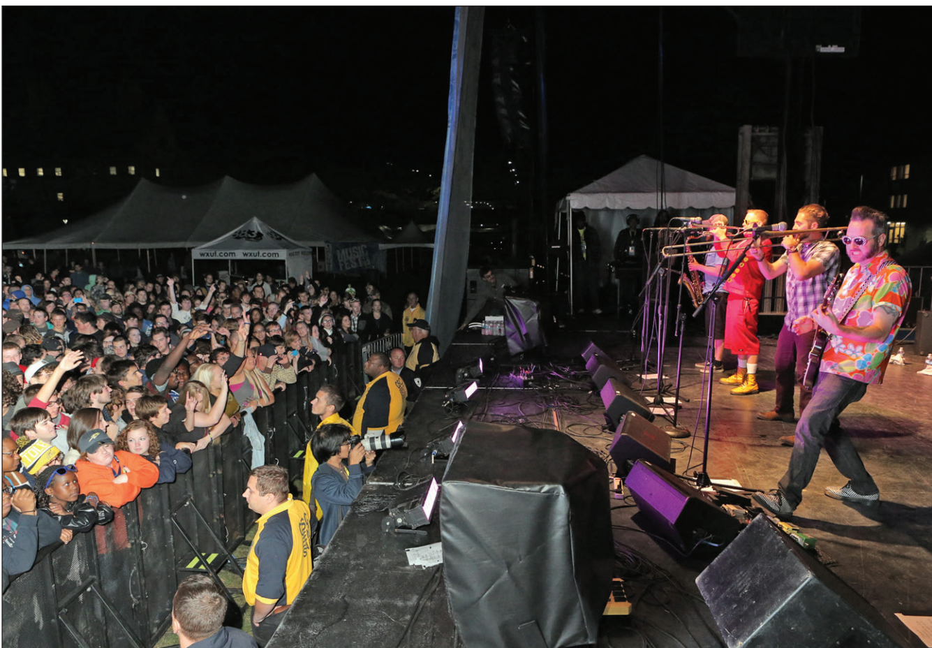
SKA'S THE LIMIT! Reel Big Fish had fun with a high-energy set that included the crowd favorite "Beer."