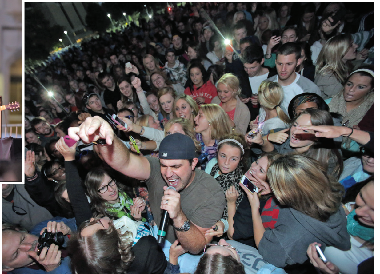
GETTING INTO MUSIC FEST: Josh Gracin thrilled fans by going into the crowd.