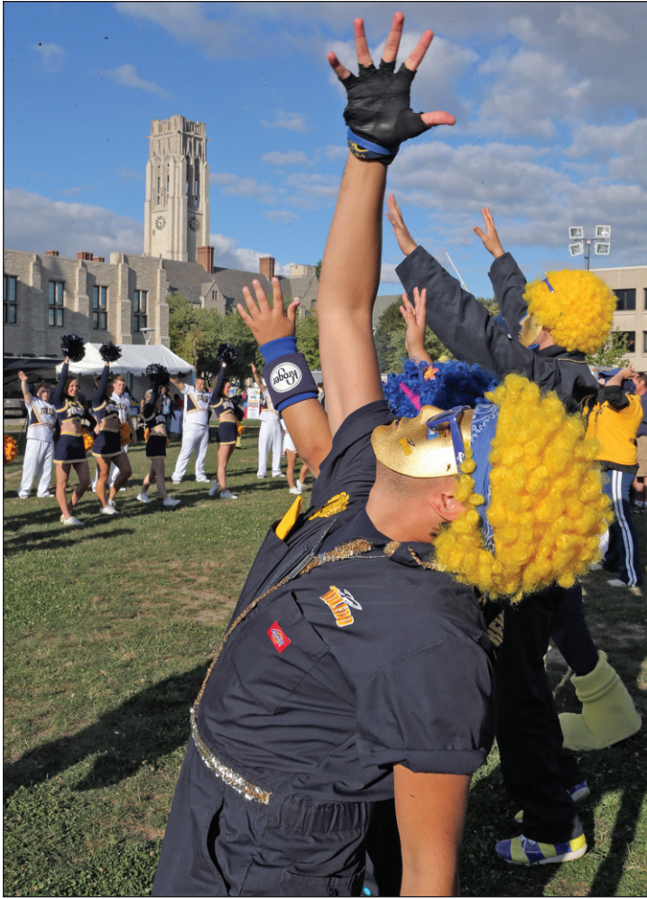
PEP BOYS: Blue Crew members psyched up fans for the Rockets' home opener at the pep rally during Music Fest.