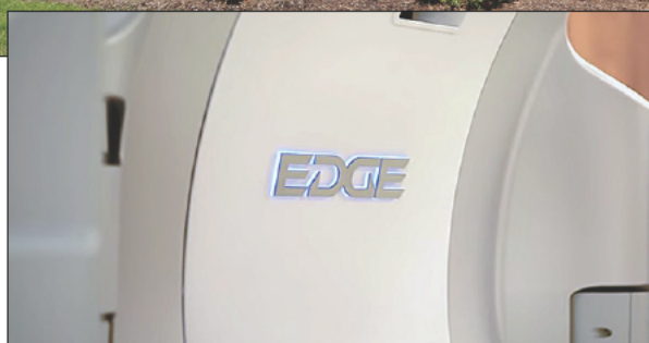
The Eleanor N. Dana Cancer Center is the home of the Edge radiosurgery system.