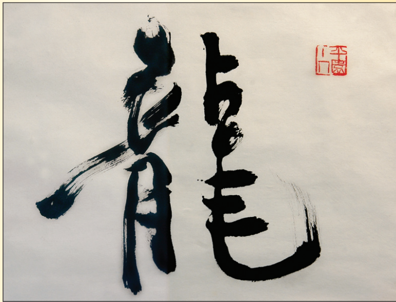
"Dragon," Chinese calligraphy by Shichang Hu