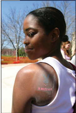
Tattooed! page 3