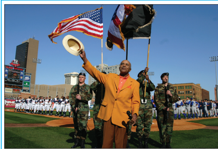
Opening act: Jon Hendricks, Distinguished University Professor of Jazz, waved to the sold-out crowd at Fifth Third Field after singing the national anthem at the Toledo Mud Hens' home opener April 15.