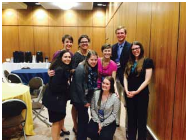
Graduate students at the MGRS