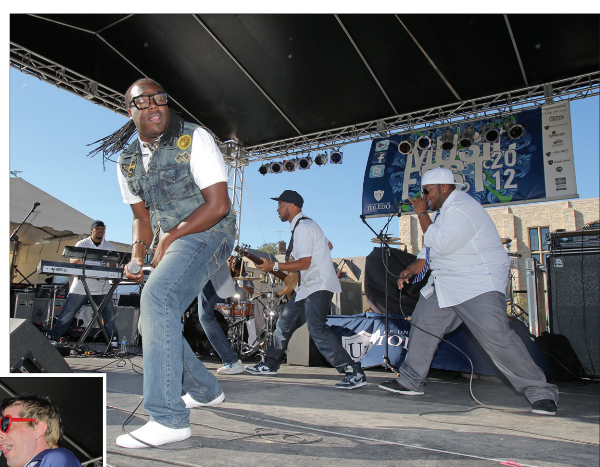
GETTING FUNKY: Hot Sauce motored down I-75 from Detroit to play Music Fest.