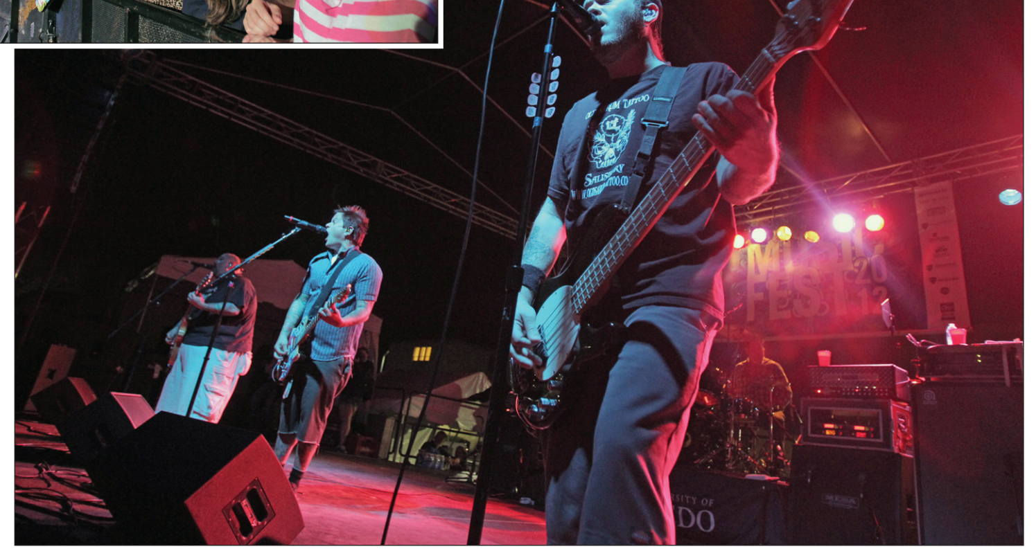
SOUP'S FUN: Bowling For Soup brought its special brand of humor to close out Music Fest.