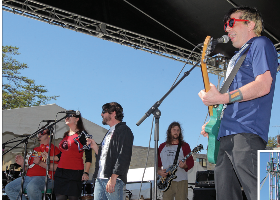
OPENERS: The Dumb Easies, a band from Bowling Green, took the stage to open Music Fest.