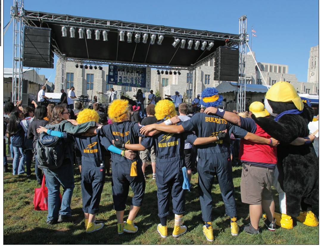
COMING TOGETHER: Blue Crew watched Hot Sauce jamming.