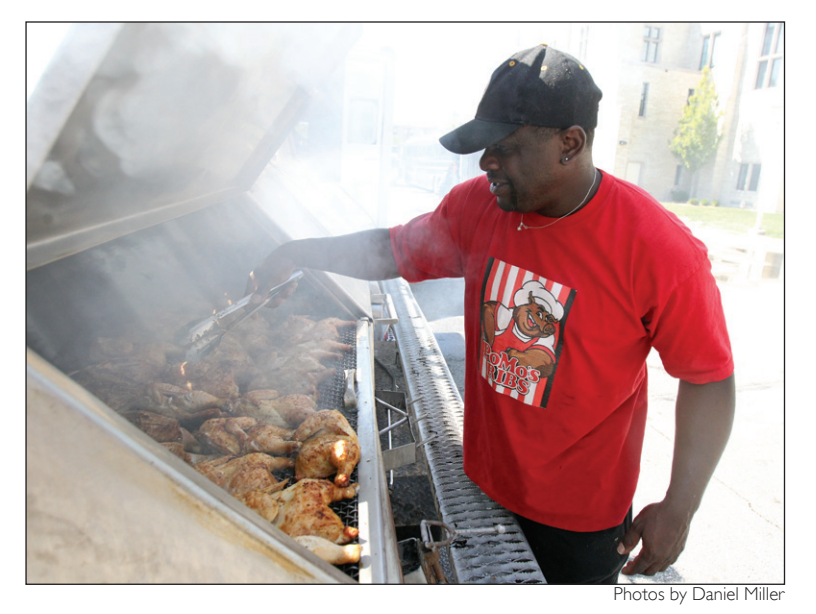
GRILL MASTER: Po Mo's Ribs of Toledo was on campus to serve up some chicken.