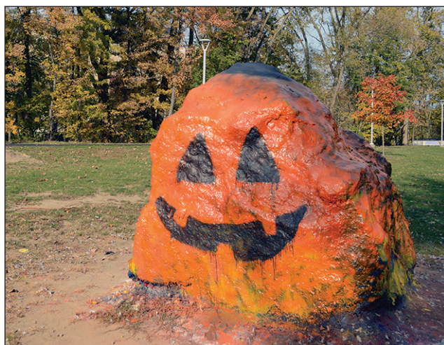
The spirit rock was ready for Halloween last week.