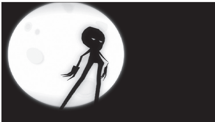
This still is from "The Figure and the Mind" by Crista Constantine.

Tickets to the showcase cost $5 for the general public and $3 for students and seniors 60 and older.