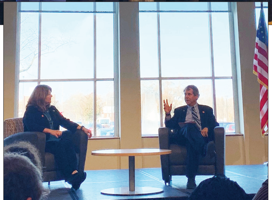
Pulitzer Prize-winning journalist Connie Schultz and U.S. Sen. Sherrod Brown spoke last month at the Propel Collegiate Leadership Summit.

The speakers in each session conducted themselves with such a high level of professionalism without presenting