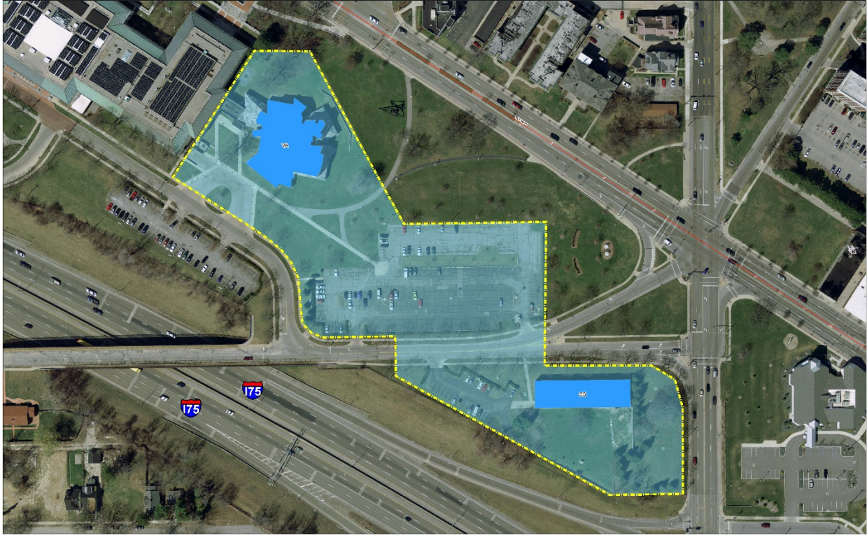
THE UNIVERSITY OF TOLEDO - Museum of Art Campus