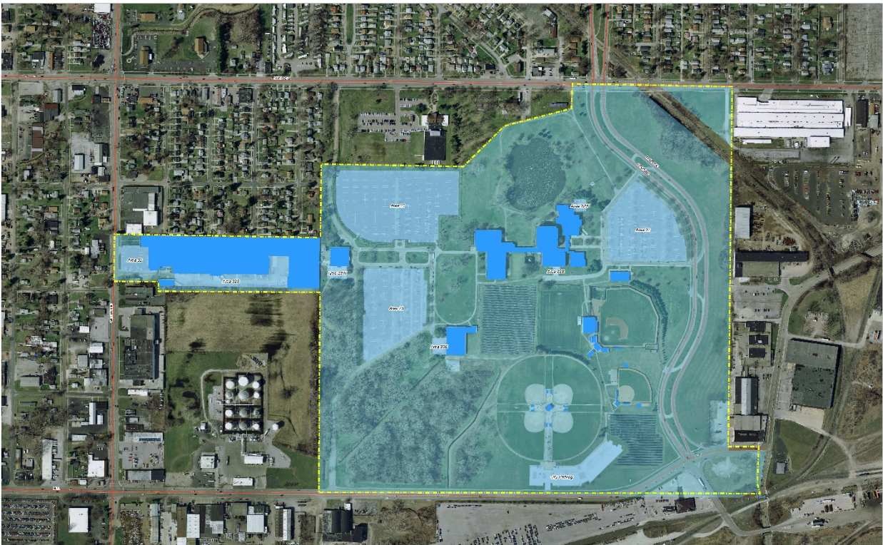
THE UNIVERSITY OF TOLEDO - Scott Park Campus