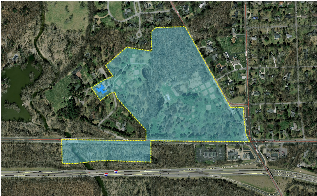
THE UNIVERSITY OF TOLEDO - Stranahan Arboretum