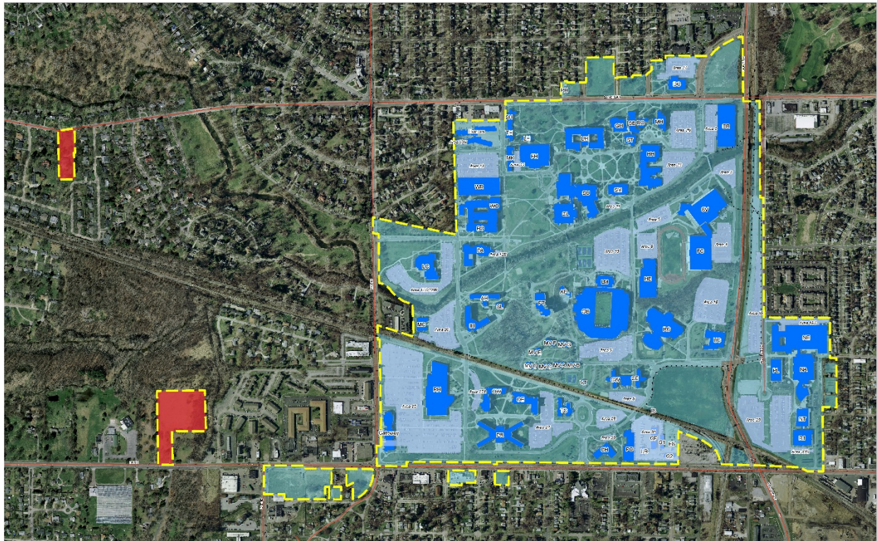
THE UNIVERSITY OF TOLEDO - MAIN CAMPUS

In 2019, according to the Clery Act, The University of Toledo had eight separate campuses. They are: