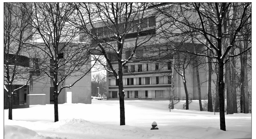
UT Photographer Daniel Miller took this snowy shot on Health Science Campus.