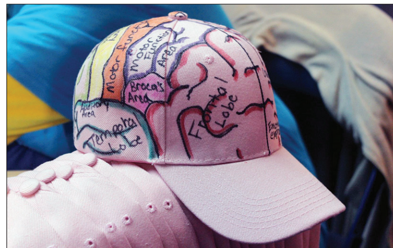
Nearly 400 joined the March for Science in Toledo April 22. The rally and march were followed by teach-ins and hands-on learning activities at Imagination Station. The Northwestern Ohio Chapter of the Association for Women in Science and Imagination Station sponsored the events.