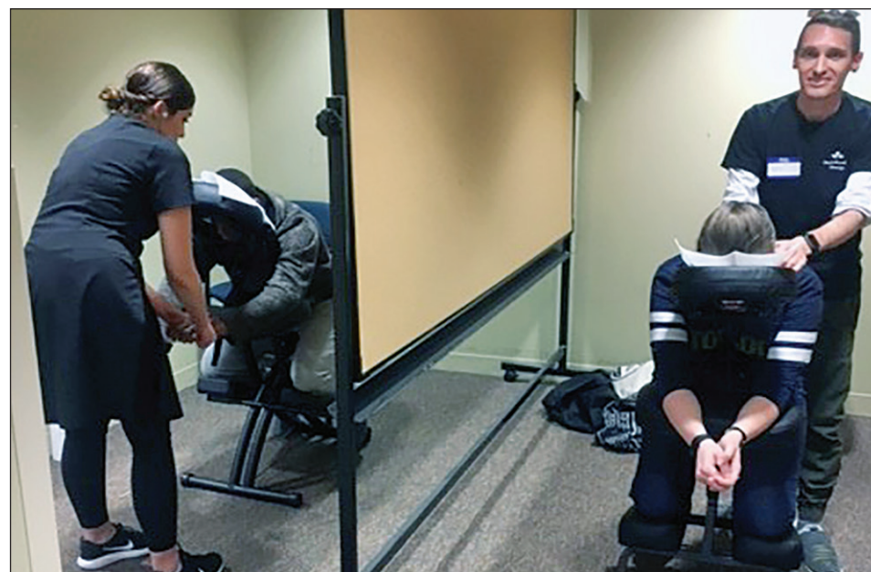
RELAX: Business owners of OZA Day Spa and Much Kneaded Massage gave students free massages to help them relax during the April 21 Wellness Fair.

Chi Sigma Iota hopes to bridge the gap between community organizations that promote wellness and students, who, more than most, need balance and wellness in their lives.