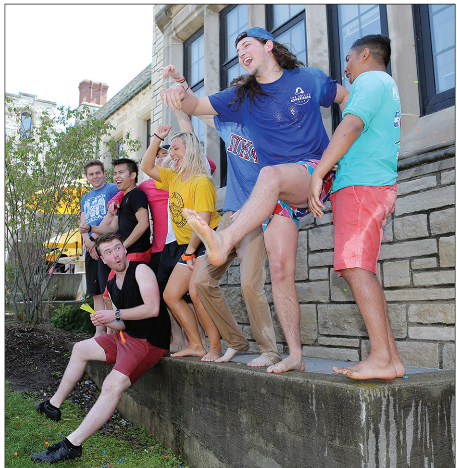
Students didn't mind getting hit with water balloons as temperatures soared into the 80s.