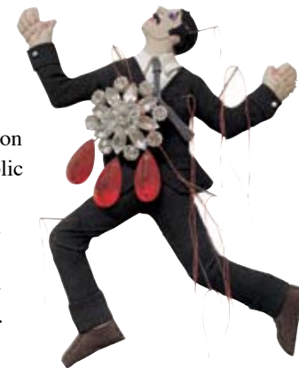
"Pincushion (daily voodoo)" by Jirí Cernický

For more information on the free, public lectures and exhibit, visit the Web site at www.cd-idczzechart.utoledo.edu or call the art department at Ext. 8300.