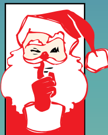
Secret Santa page 5