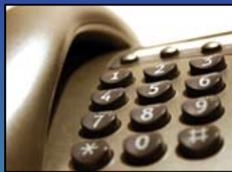
Just say it page 3

• Informational meetings, Tuesday, Nov. 8, at 7:30 a.m. and 10 p.m. in the Police Department's squad/training room • Voting, Tuesday Nov. 8, through Thursday, Nov. 10, at 3 p.m. in the Police Department's squad/training room