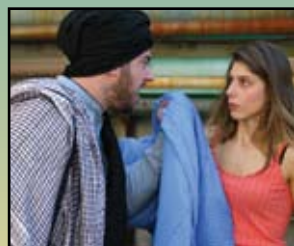
Drama unveiled page 5