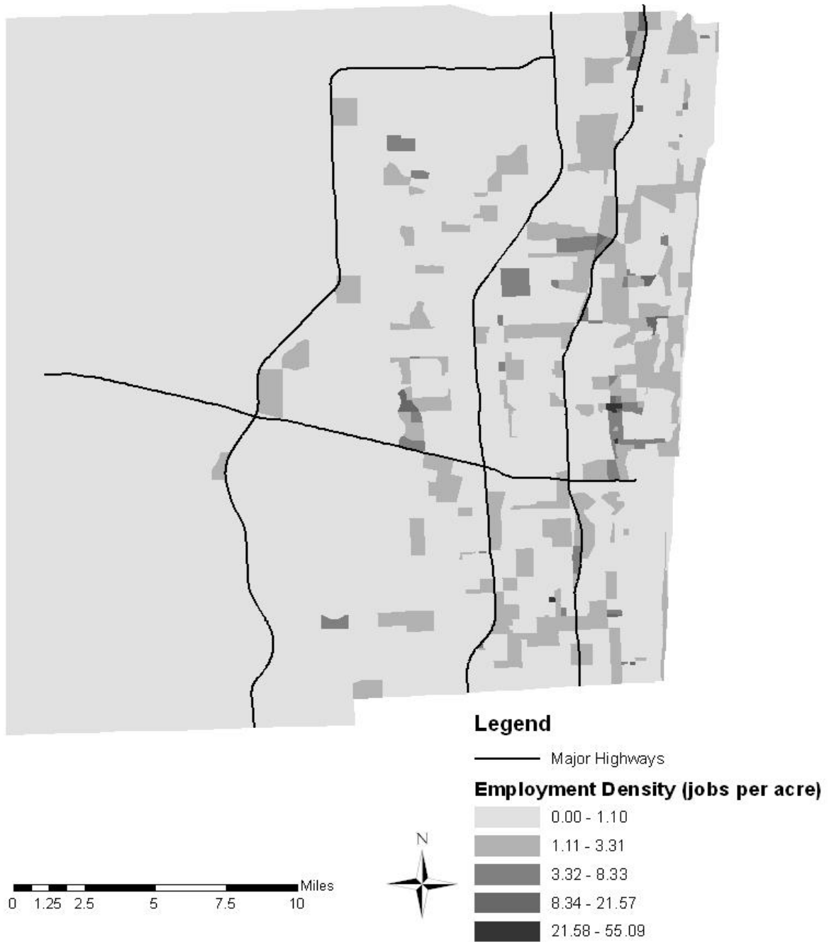
FIGURE 1 Employment density in Broward County, Florida in 2000.