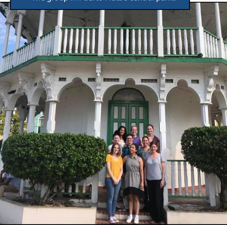
The group in Puerto Plata's central park..

The research project involved taking anthropometric measures of children who attend the school operated by the UT group’s local partner organization, which serves primarily Haitian immigrant children. The measurements included height, weight, arm circumference and skinfolds and were analyzed to determine growth patterns. The purpose was to identify children experiencing growth stunting and who were underweight, overweight, or obese. The project also involved capacity training. The faculty and students taught 18 local teachers and school staff how to take measurements, calculate Body Mass Index, and determine growth issues, so that they would have the knowledge and skills to track the growth of their students. During the second half of the semester, the group