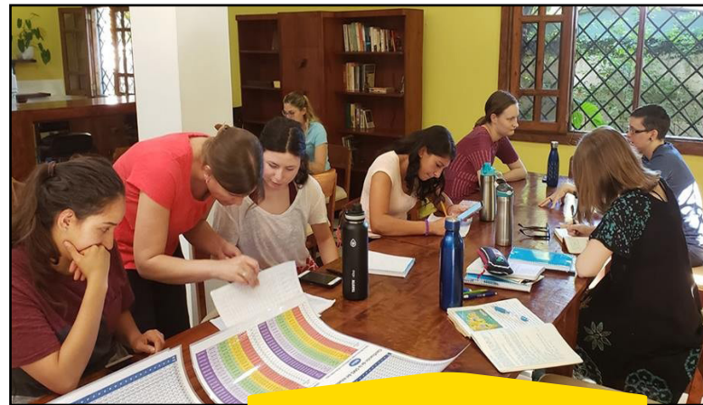
Students working on data analysis