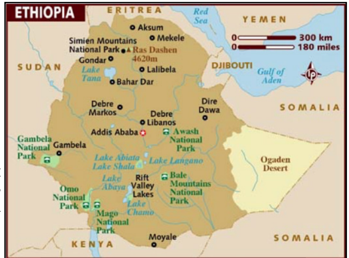
Ethiopia, located in the Horn of Africa.

This program offers a unique opportunity for a diverse set of qualified academics to advance scholarship in Ethiopia as full-time teaching faculty member at Ethiopian institutions of higher education. The aim of the program is to strengthen Ethiopian universities' capacity to teach and manage undergraduate and graduate programs and enhance research capacity within Ethiopian universities ( https://www.iie.org/Programs/Ambassadors-Distinguished-Scholars-Program ).