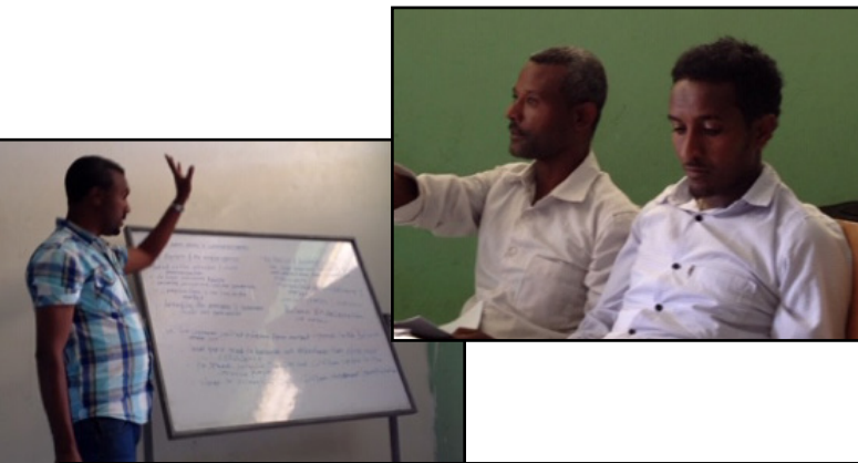
Bahir Dar University, Public Administration Master Students engaged in active learning activities.

These major political and economic shifts occurring both in the global and domestic environment has prompted the Ministry of Education to reexamine their strategic needs in higher education to build a more creative and innovative workforce as a nation. As such, they are exploring how to model their tertiary educational system after the U.S. educational model. Ethiopian