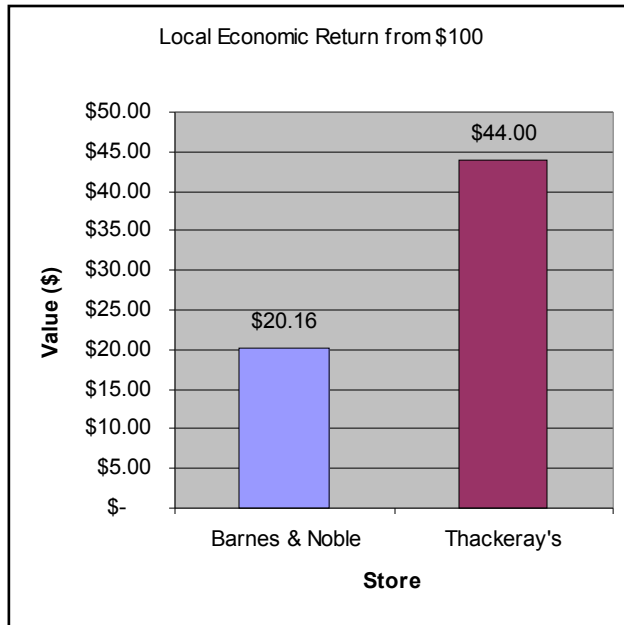
Table 2. Local Economic Impact