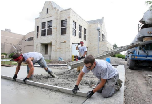
Above: workers use a board to smooth out concrete poured in June 2010 as part of the Student River Plaza behind the Student Union and Carlson Library