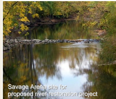
Savage Arena site for proposed river restoration project