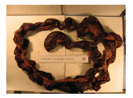
Figure 1. Gross specimen of resected small intestine.