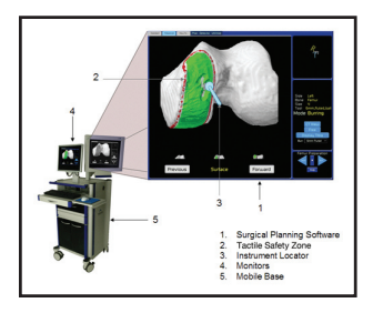
Rendering of Mako Surgical's Makoplasty surgical robot which is used for knee arthroplasty.

four regions of active constraint. The safe region means that the surgeon is away from soft tissue and free motion is permitted. The close region means the surgeon is near soft tissue and motion is partially constrained by the robot. The boundary region means the surgeon is about to touch soft tissue and motion is severely constrained. Finally, the forbidden region means the surgeon is cutting into the soft