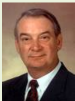
Dr. Ferid Murad