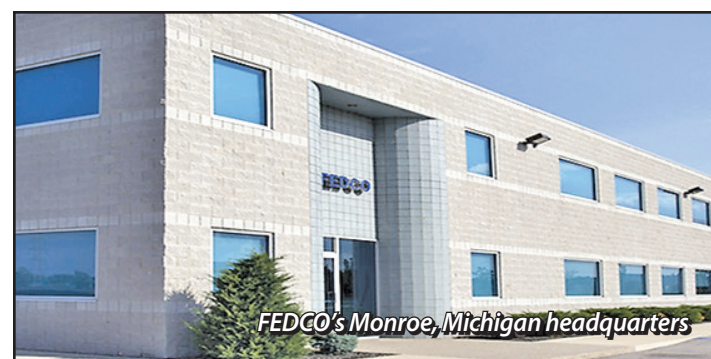
FEDCO's Monroe, Michigan headquarters