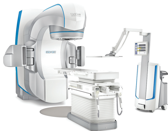
Varian Edge System

The Eleanor N. Dana Cancer Center is installing a $4.5 million Varian Edge System to treat cancer patients at The University of Toledo Medical Center (UTMC). The oncology unit expects the new radiosurgery technology to begin treating patients sometime in August.