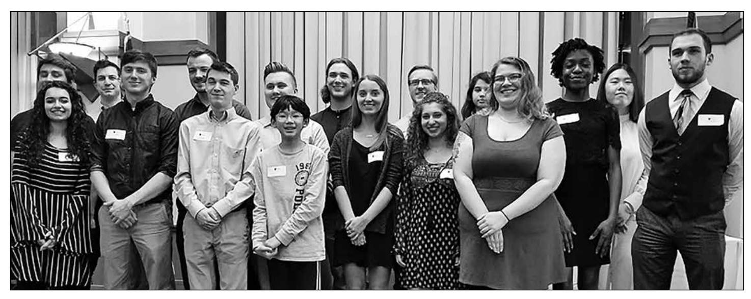
2018 Honors Tea scholarship and award recipients.