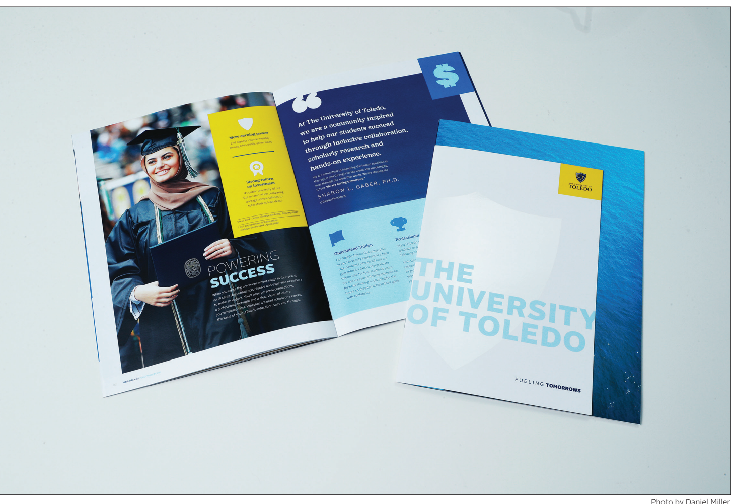
GOLDEN: The UToledo undergraduate viewbook received a Gold Addy from the Toledo American Advertising Federation and automatically will be entered into the district contest.

UToledo's gold award-winning entry at the local level will automatically be entered into the district contest as the next