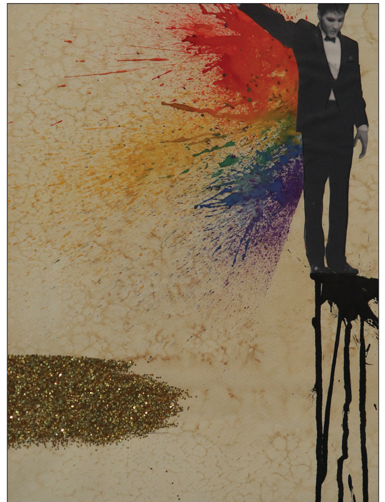
"The King," mixed media, by Angelina Zarate, recipient of the Inga Reynolds Award for work on paper