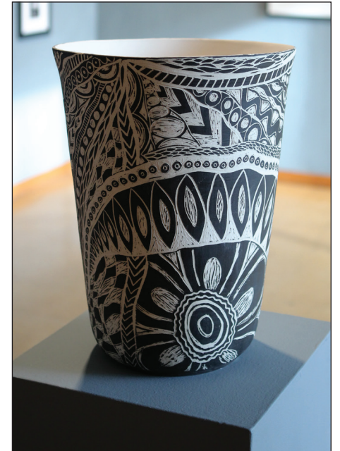
"Woodblock," porcelain, by Tara Bycznski