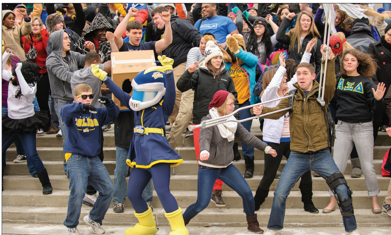
SHAKE, SHAKE, SHAKE: Rocky the Rocket danced alongside students doing the Harlem Shake, an Internet video trend, last week on the steps of the Student Union. Watch the video at http://utole.do.shake .