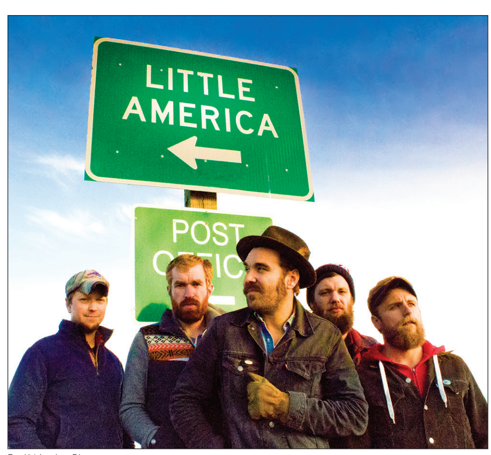
Red Wanting Blue

"I think, at the end of the day, a song lasts if you can make something really meaningful with the words. I try my best to perform songs as honestly as I can, and I try to write them as honestly as I can," he said.