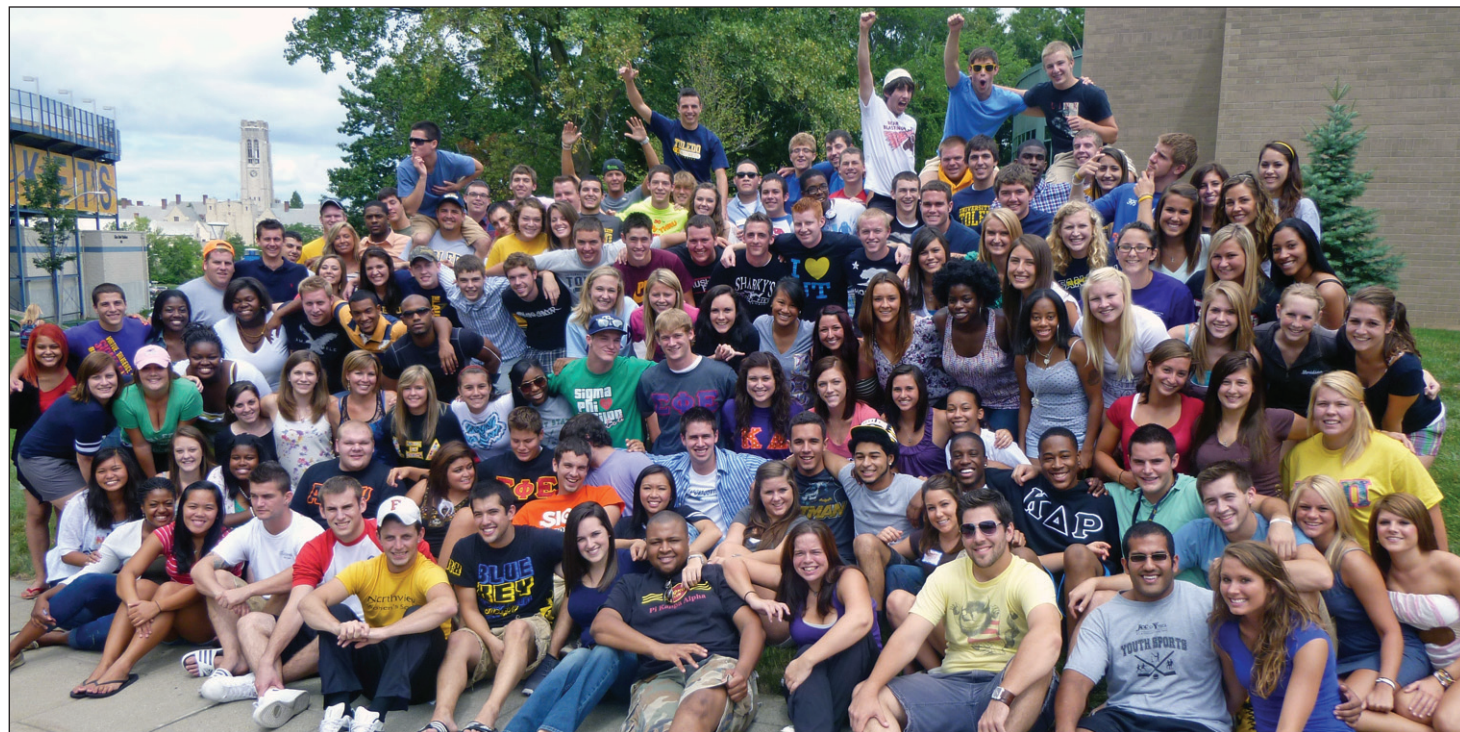
The UT Student Wellness At Toledo (SWAT) Team is the largest collegiate peer education team in the country.

College peer education programs thrive in a health and wellness environment where they can reach people, motivate