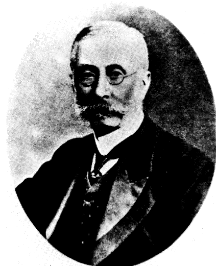
Fig 1.—David Ferrier (from Critchley 1 ).

two thirds of the "superior temporo-sphenoidal convolution", ie, the superior temporal gyrus (Fig 2). Ferrier found that stimulating this area resulted in the following: "pricking of the opposite ear, head and eyes turn to the opposite side, pupils dilate widely." Yet how did Ferrier know that he was stimulating an auditory area and not a somatic or motor area? Ferrier said, "These phenomena resemble the sudden start and look of astonishment or surprise which are caused when a loud sound is made in the ear opposite the hemisphere which is being irritated." In other words, electrical stimulation of the superior temporal gyrus produced the same startle reaction as sounding a "shrill whistle" close to an animal's ear.