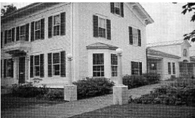
8. McDonald's, Freeport, Maine. McDonald's proposed to demolish this historic home. The town rejected McDonald's demolition request. McDonald's renovated and used the existing building and added a wing to the building that matches the design of the original structure. The only signage is incorporated into the "pavement".