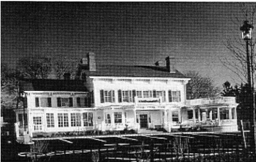
7. McDonald's, New Hyde Park, New York. The community prohibited McDonald's from demolishing this 1860's house. McDonald's restored the house and used the house for its store.