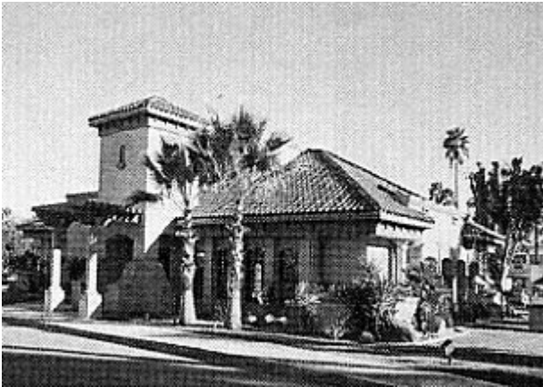
10. Pizza Hut, Palm Springs, California. Pizza Hut agreed to forgo its prototype building design and built a structure that is very compatible with its surroundings.