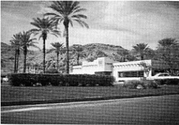
1. Burger King, Cathedral City, California. New building that was designed to meet local design standards that emphasize the local Pueblo style architecture.

This is accomplished either through the use of existing structures or in the design of new structures that are sensitive to local "character".