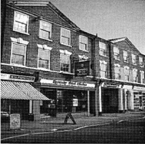
6. Kentucky Fried Chicken, Newark on Trent, England. Signage and façade match existing historic streetscape character.