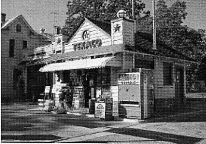
12. Texaco Gas Station, Brookmont, Maryland. Uses an historic neighborhood-scale building and maintains signage and accessories appropriate to the era of the building.