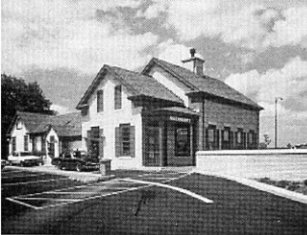
9. McDonald's, Hudson, Ohio. Design respects local character.