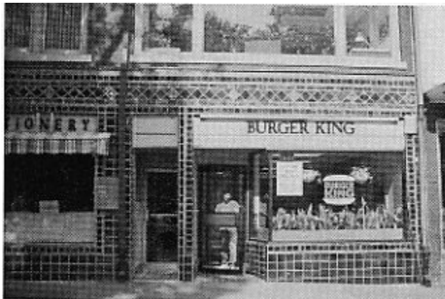
2. Burger King, Princeton, New Jersey. Burger King used an existing building on a heavily regulated main street. Burger King's design took advantage of the tiles in the Arts & Crafts style building.