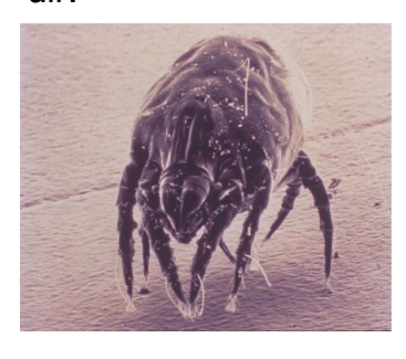
North American and European Dust Mite. .

begin to negatively affect the quality of air