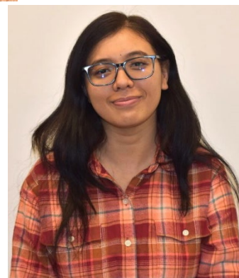
UPSASANA Can binge-watch FRIENDS for hours to days