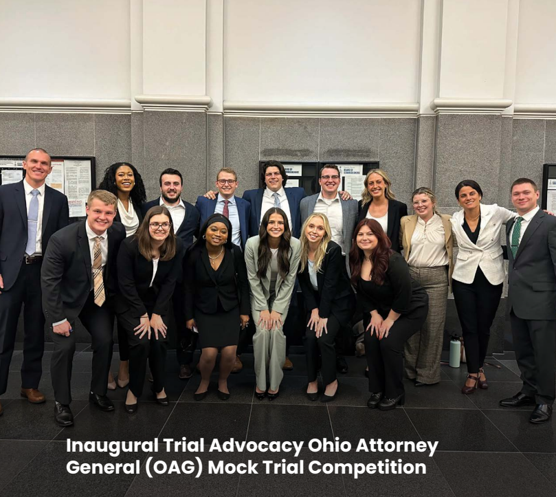
Inaugural Trial Advocacy Ohio Attorney General (OAG) Mock Trial Competition