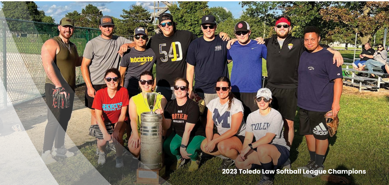
2023 Toledo Law Softball League Champions