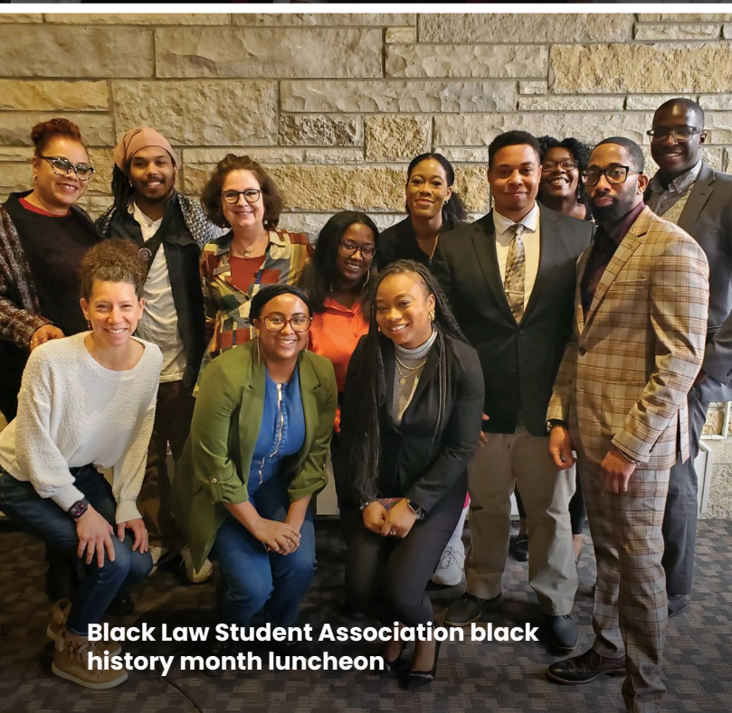
Black Law Student Association black history month luncheon