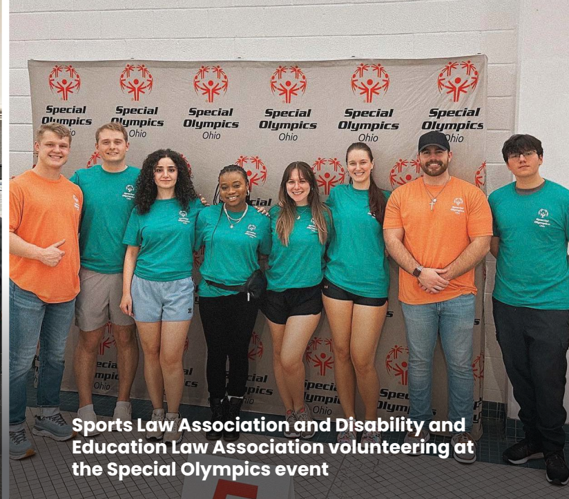
Sports Law Association and Disability and Education Law Association volunteering at the Special Olympics event