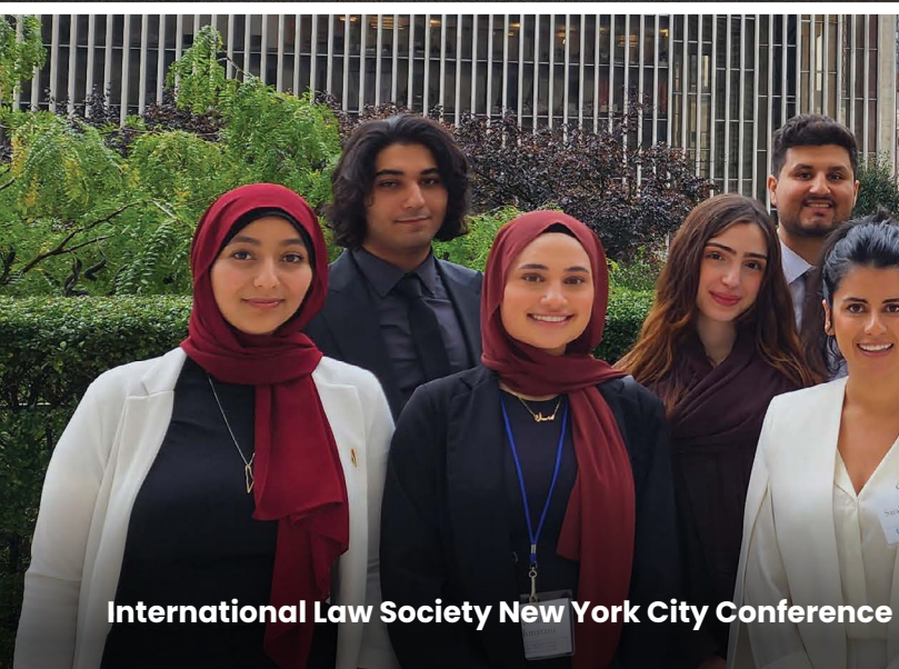
International Law Society New York City Conference