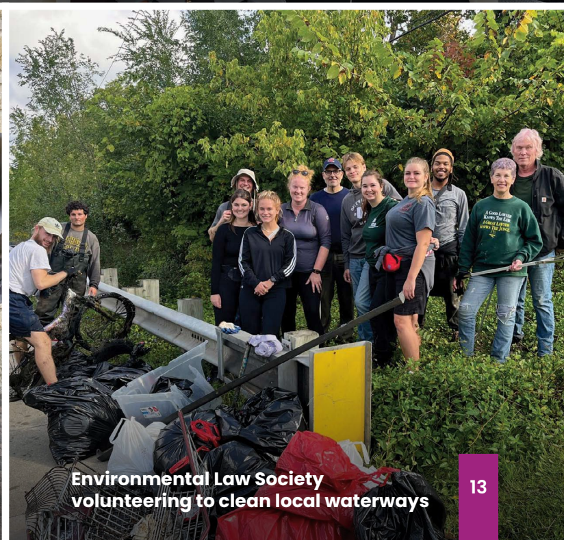
Environmental Law Society volunteering to clean local waterways