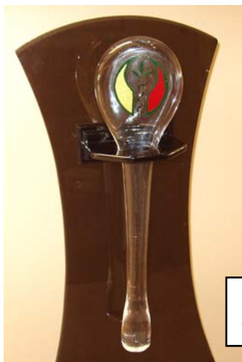
This glass mace was used in graduation ceremonies.

In addition to rare medical books, artistic treasures of local significance can be found in the Watterson Room. A profile of Raymon H. Mulford ( shown above ) and a mace ( shown to the left ), examples of glass art by the internationally acclaimed artist Dominick Labino, are on permanent display.