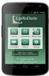
UpToDate for Android™ devices