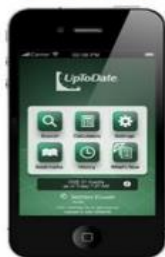
UpToDate App for iPhone and iPad