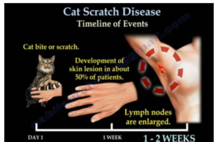
Timeline for Cat Scratch Disease

Swollen, tender or hard lymph nodes could be confused with a soft tissue tumor. These areas of lymph node concentration include: