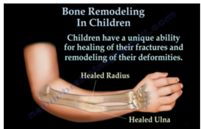
Children have a unique ability for healing of their fracture and remodeling of their deformities.

Second of importance, revolves around distance of the fracture from the end of the bone. Fractures in the metaphysis remodel better than in the middle of the bone.