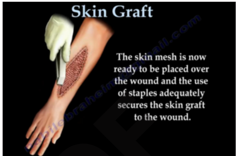
A skin graft refers to a thin slice of healthy skin that is transplanted from one area of the patient's body to the area that is injured or damaged

Prior to the skin graft being harvest and applied, the wound should be debrided, excised and measured. The jet lavage is commonly used to thoroughly cleanse the wound. A skin graft involves cutting a thin slice of skin from the donor area. The skin sample is commonly taken from the area of the thigh, but can also be taken from the arms and gluteal regions. The donor skin is meshed, which will cut tiny slits in the graft, allowing the graft to be stretched for covering large areas of the wound, using less skin. The skin graft is then placed over the wound with staples to adequately secure the skin graft.