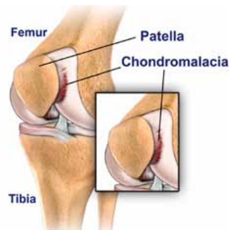
Depiction of chondromalacia

Knee pain is a relatively common problem that can be attributed to conditions and injuries including: chondromalacia, pre-patellar bursitis, patellar subluxation/dislocation and fractures of the patella.