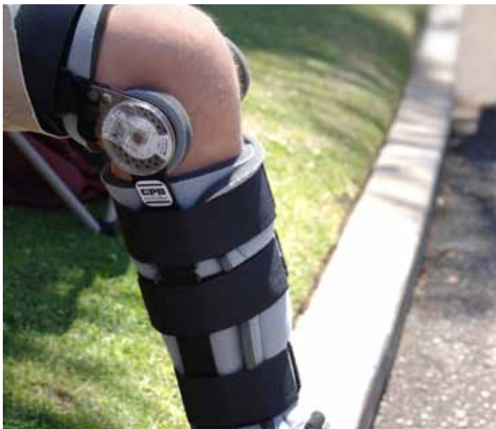
ACL injury rehabilitation

UTMC's Department of Orthopaedic Surgery, in conjunction with the University of Cincinnati, recently received a grant for over $2 million (approximately $1.2 million will come to UT) to study female anterior cruciate ligament (ACL) injuries.