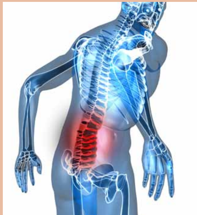
Depiction of lower back pain

While most patient complaints are genuine and sincere, there are times when patients fabricate or exaggerate symptoms of physical disorders. This type of patient is known as the malingering patient, a medical and psychological term that refers to an individual fabricating or exaggerating the symptoms of mental or physical disorders for a variety of reasons.