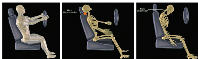
Rendering of the hyperextension and hyperflexion forces the neck sustains during a motor vehicle accident.

Radiographs or other imaging may also be utilized to determine if a fracture exists and to assess the condition of the cervical spine's soft tissue. The physical examination should