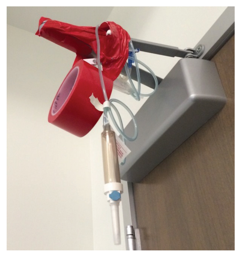
Students used a variety of medical supplies on hand to immobilize the automatic door-closer hinge to bar entry.

I = Impede: If the option is to hide from the assailant, then the objective is to create a fortification that will block or deter an assailant's entry into one's hiding area using items that are available in the patient care area