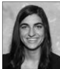
Grace Burket Residency: Internal Medicine Case Western Reserve University Hospitals Cleveland Medical Center Cleveland, OH