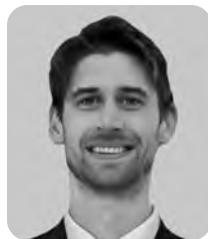
JB Rudisill Medical Physics