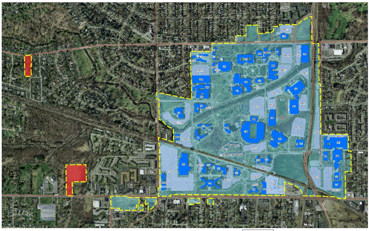
THE UNIVERSITY OF TOLEDO - MAIN CAMPUS

In 2020, according to the Clery Act, The University of Toledo had eight separate campuses. They are: