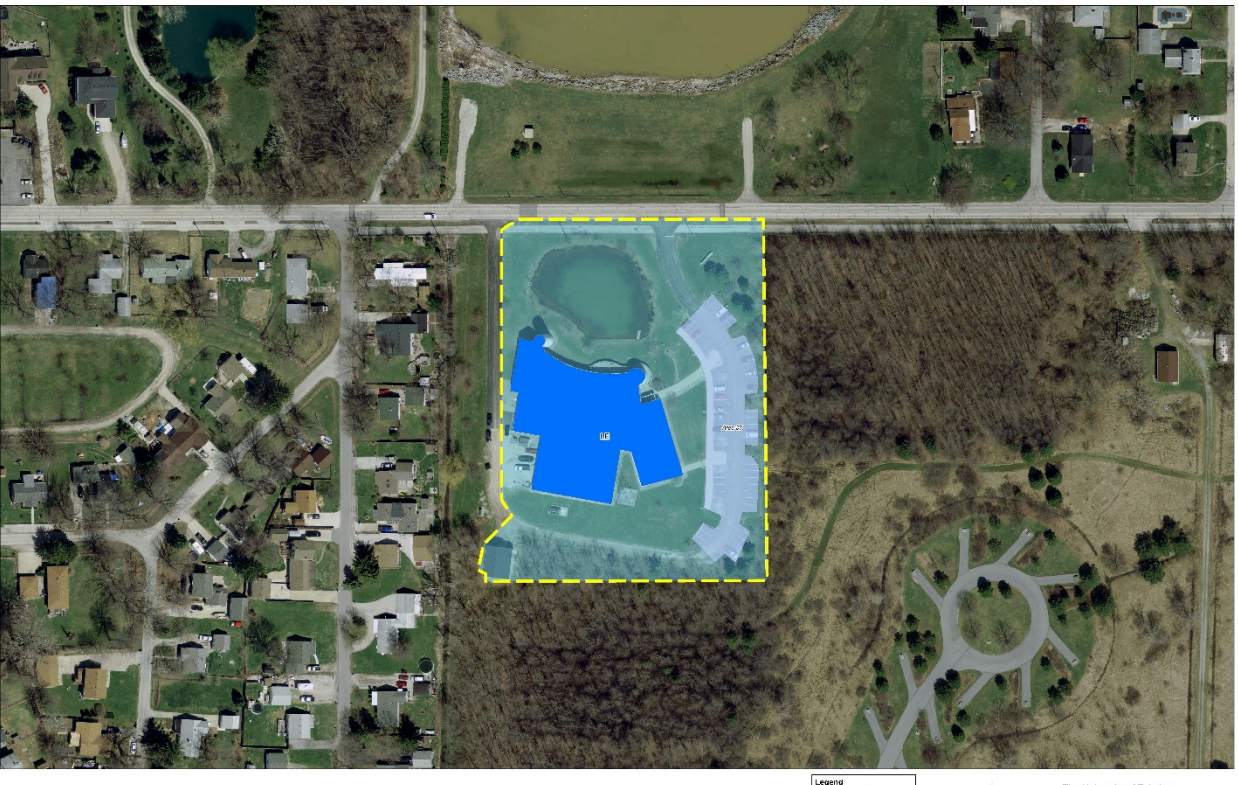
THE UNIVERSITY OF TOLEDO - Lake Erie Center