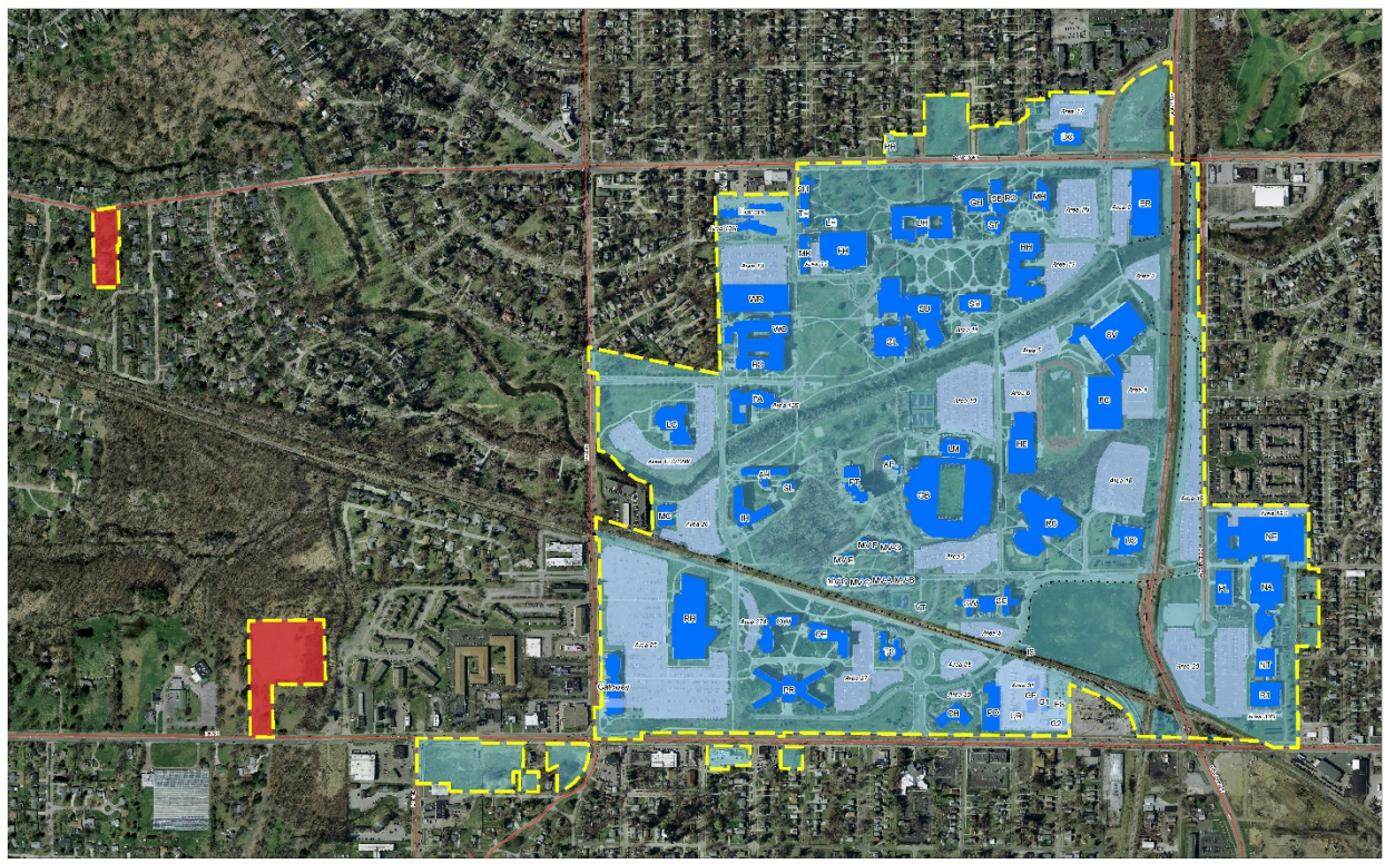
THE UNIVERSITY OF TOLEDO - MAIN CAMPUS

In 2021, according to the Clery Act, The University of Toledo had eight separate campuses. They are: