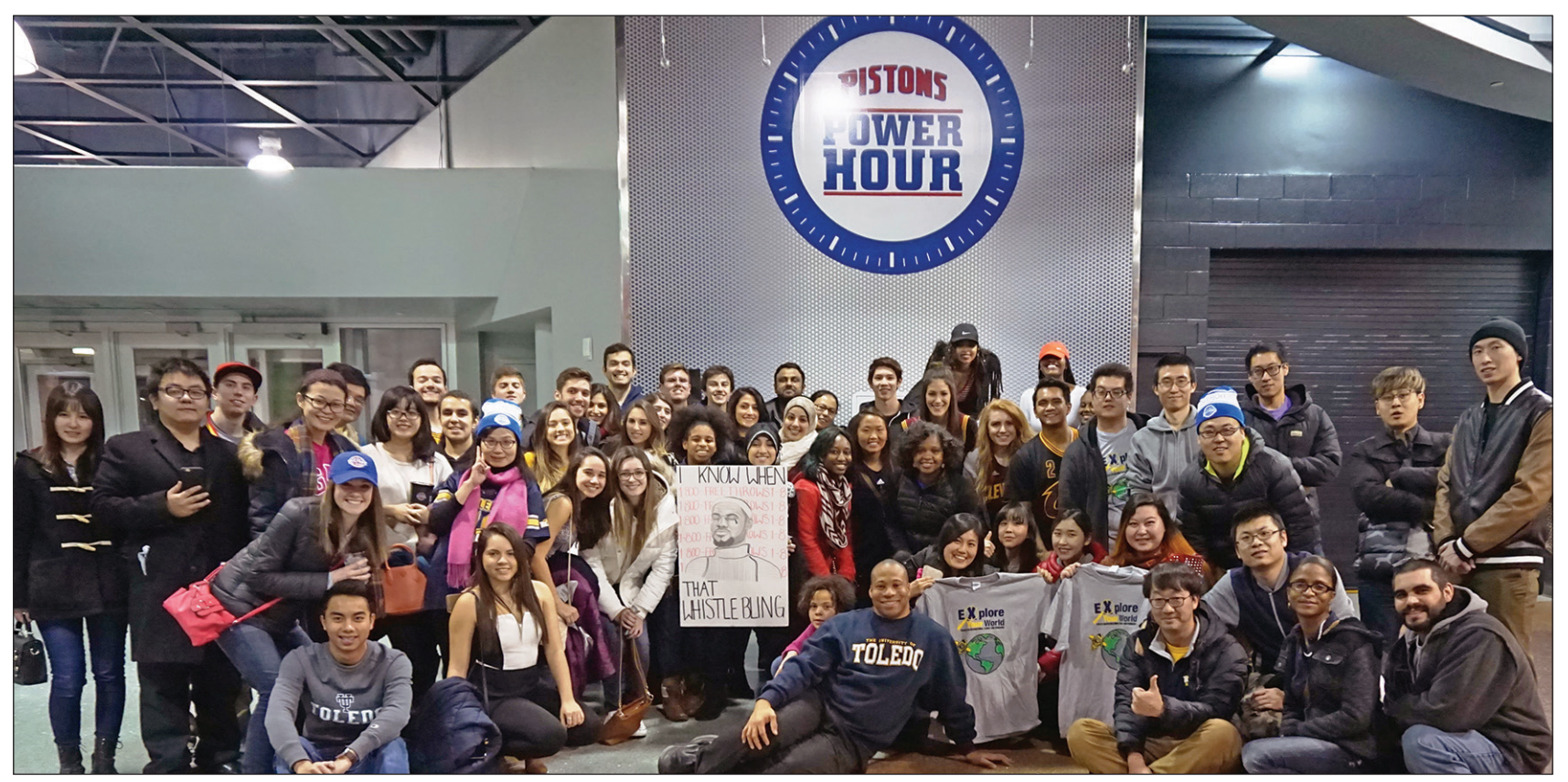
Some 80 students recently motored north to watch the Detroit Pistons play the Cleveland Cavaliers at the Palace of Auburn Hills. Sponsored by the Division of Student Affairs and the Center for International Studies and Programs, the road trip was one of many initiatives designed to bring together international and domestic students.