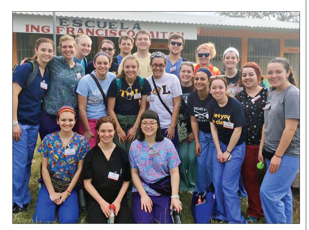
MAKING A DIFFERENCE: Students from the UT chapter of Global Medical Brigades posed for a photo with some peers from the University of Hartford in front of a school where they set up a medical clinic in Tomatin, Honduras.

Together, the students from UT and the University of Hartford were able to raise enough money to bring $8,000 in