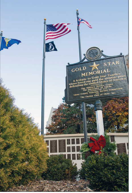
at the UT Veterans Memorial Plaza, an outdoor area that honors individuals and groups who served in the U.S. military.

SPECIAL RECOGNITION: The Gold and Blue Star Memorial markers were unveiled in November