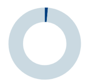
Positivity rate: 1.4%

Residential students in self-isolation on campus: 6