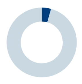
Current occupancy in on-campus isolation housing: 4.3%

Residential students in self-isolation on campus: 6