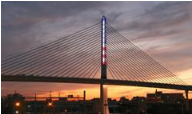
The pylon in the center of the Veterans' Glass City Skyway bridge over the Maumee River in Toledo, Ohio will be lighted with electricity from solar arrays in the highway right of way

The Veteran's Glass City Skyway bridge that carries Interstate 280 over the Maumee River in Toledo, Ohio is a cable-stayed bridge with a 196 foot lighted pylon in the center containing 384 light emitting diode fixtures. This pillar of light is the main attraction of the bridge with colors programmed to reflect holidays, seasons and important community events. The glass facing on all four sides is homage to Toledo's history as the center of the nation's glass industry during the last century.