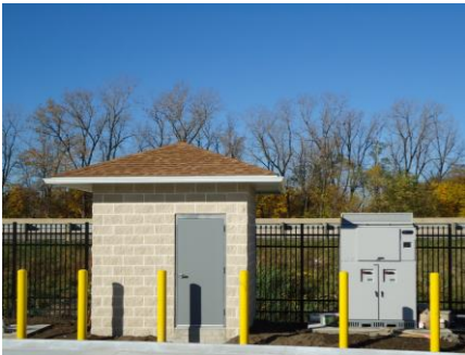
Building at the array site to house instrumentation for the solar research project.