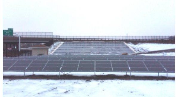
Solar arrays in the I-280 interchange at the north end of the VGCS bridge. Xunlight panels are mounted on a membrane on the overpass embankment ; First Solar panels are mounted on frames as shown in the foreground.

The solar array which provides the basis for the study project consists of a 100 kW (peak) utility grid tied photovoltaic (PV) system. The PV system was designed to generate an average of 280 kWh per day or 102,200 kWh per year to offset the electricity