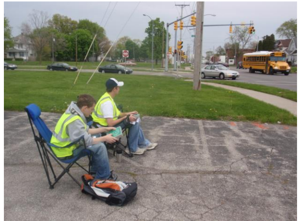
UT students taking traffic counts for data to be used in an application for Safety Program funding from the Ohio Department of Transportation.

improved turn lanes, sidewalks/curb ramps, and crosswalk visibility; bump outs, median refuges and additional turn lanes where needed.