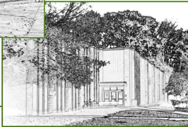
Health Ed Building