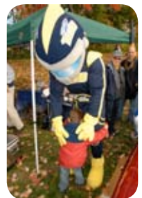
Parents & Family Weekend 2008

COMING SOON: A parent's website that will provide more family resources as well as upcoming family events. For more info, contact the Office of Dean of Students at parentinfo@utoledo.edu .