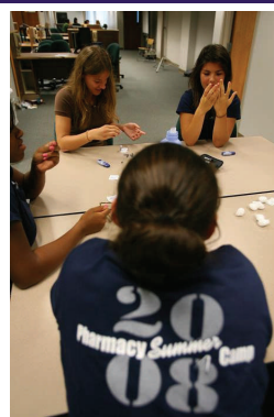
Pharmacy campers learn to test blood glucose levels

More than 80 high school seniors from across the country made summer camp at UT their prescription to success. Pharmacy Summer Camp, a four-day camp that informs students about careers in pharmacy, was once again a success in 2008. Read more