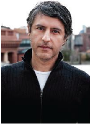
Dr. Reza Aslan