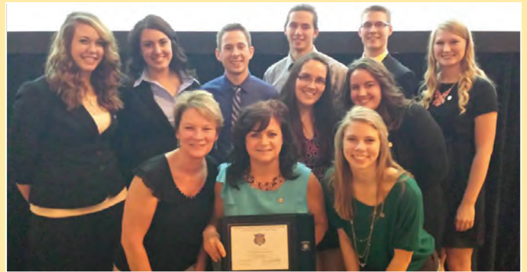
Receiving the Award for the NSNA Stellar School Chapter in Nashville

The College of Nursing celebrated the announcement in April with cake and refreshments.