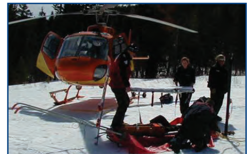
Critical Care Transport team responding to an incident.